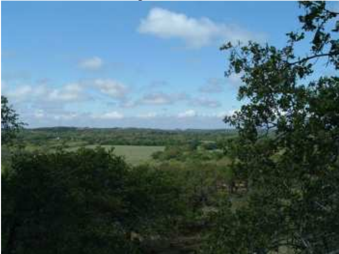
View from Eagle Mountain at Eagle's Wings

I frequently am asked, so what's next? We have been very successful in accomplishing quite a bit in our first couple of years. I was thinking today it's much like climbing one of our Texas hills.