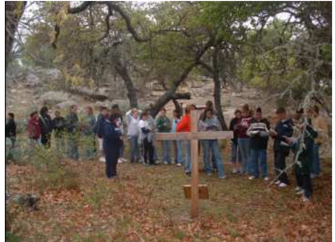
Randolph AFB Confirmation Teens doing Stations of the Cross