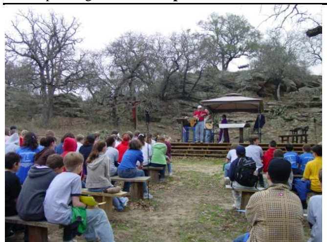
Students from St. Mary's Catholic School in Temple attend mass while on a retreat about Stewardship.