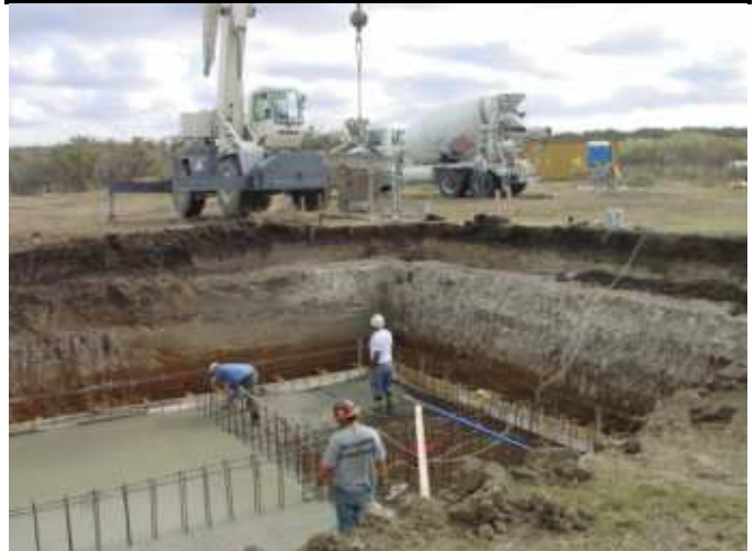
Matous's team pouring floor of waste water treatment plant Actual construction began in December 2006 when Bruce Matous Construction of Temple donated and built the new waste water treatment plant and started to rough in the roads.